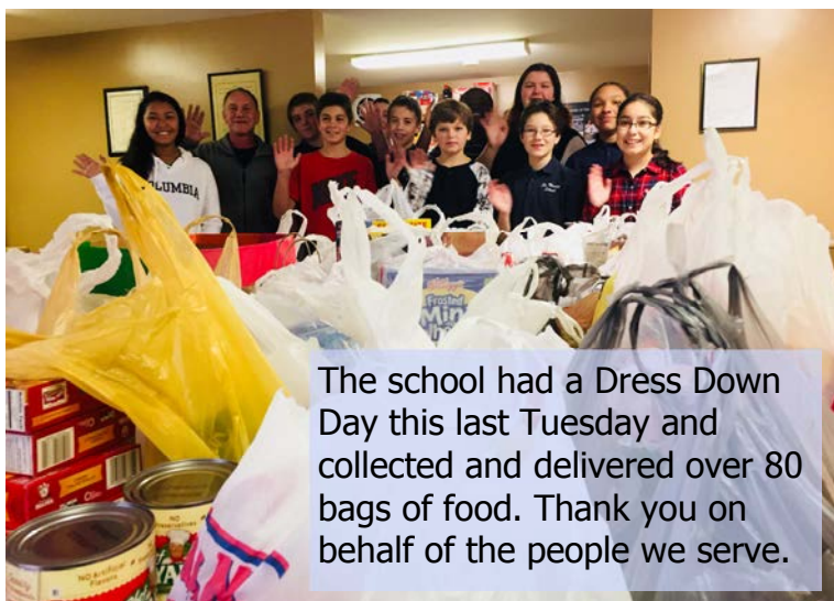
The school had a Dress Down Day this last Tuesday and collected and delivered over 80 bags of food. Thank you on behalf of the people we serve.

"For I was hungry and you gave me food" Matthew 25:35