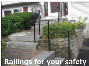
Railings for your safety